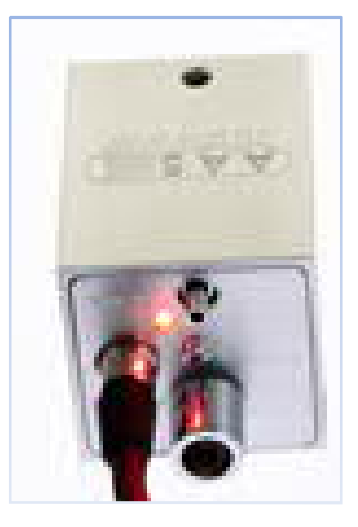
Figure 5 Close up of the ZDS Qube block. The Red light shows that heating is on. In this picture the gas ports are not connected to the anaesthetic gas delivery machine (small top port is anaesthetic gas in; the large bottom port is waste anaesthetic gas out)