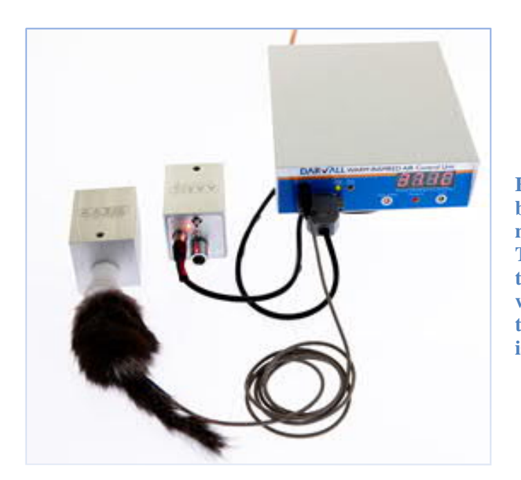
Figure 4 Shows 2 ZDS Qube. The ZDS Qu block on left shows rodent in a mask being monitored by an auxiliary temperature pro The ZDS Qube block in the centre is connec to the Heated Breathing Circuit controller which provides power and monitors the temperature of the block. The HBC control is on the right.

The Qube heating block may be used in place of the heated tube. The electrical connections are similar to those described in (a), (b) and (c) above except that the D15 cable has a 4-pin mini XLR plug on the end which goes into the Qube.